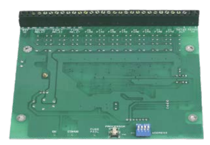
Part No. K580

Note: Also available is the Sigma Sounder Board (K461) which is compatible with all Sigma CP and CP-R panels which have operating software version V3.0 or above. See DS48 for more details.